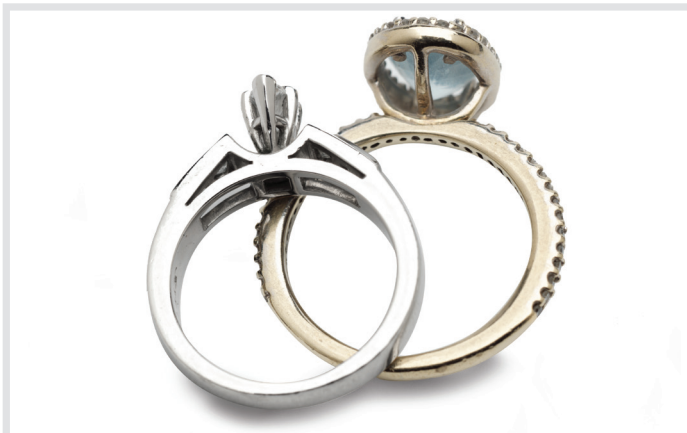
10-YEAR OLD PLATINUM RING VS. 2-YEAR OLD WHITE GOLD RING

One of the greatest distinctions between platinum and white gold is the pure, real white color of platinum. Platinum's whiteness is natural, so your customers are getting something that will not change.